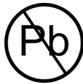
Example of Lead-Free Symbol

In February 2003, the European Union issued Directive 2002/95/EC regarding the restriction of the use of certain hazardous substances in electrical and electronic equipment (RoHS). The RoHS directive states that as of July 1, 2006, electrical and electronic equipment manufacturers must eliminate the use of all lead, mercury, cadmium, hexavalent chromium, polybrominated biphenyls (PBB) and polybrominated diphenyl ethers (PBDE) in products sold in the European Union (EU).